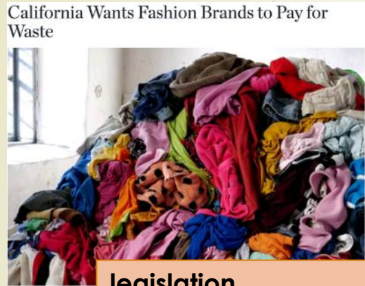
California Wants Fashion Brands to Pay for Waste